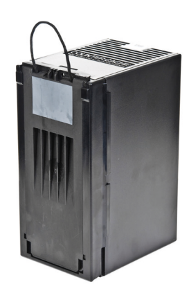
... for cassettes removed from the POS (CounterCache Classic only).