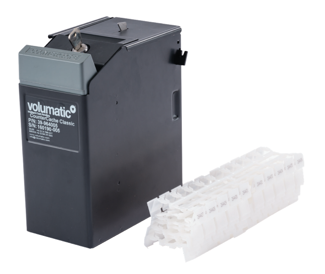
Anker Kassensysteme GmbH

Striegauer Str. 21 33719 Bielefeld (Germany)