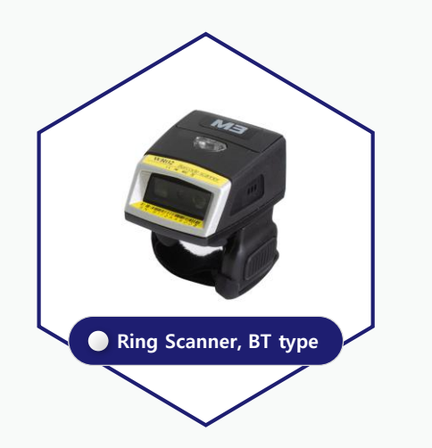
UNIV-WERS-U10 SM15 Wearable SE2707 2D Ring Scanner(Bluetooth)