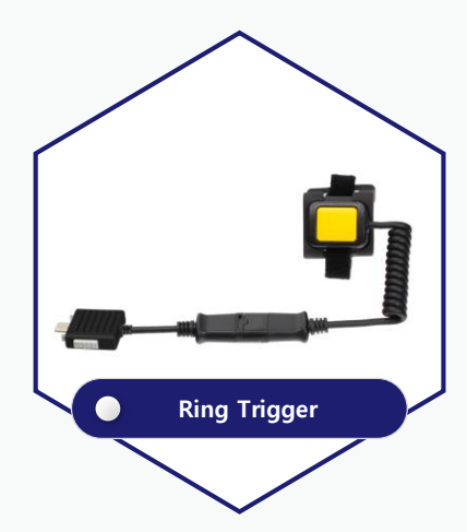
SM15-WETR-U00 SM15 Wearable Trigger with QD connection cable