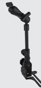
RAM® Pod HD™ Mount w/ 12" Aluminum Rod RAM-316-HD-238U