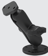
RAM® Double Ball Drill-Down Mount RAM-B-138U