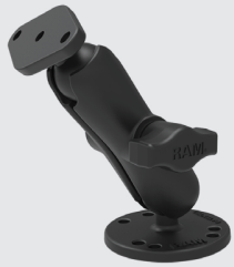
RAM® Double Ball Drill-Down Mount RAM-B-138U