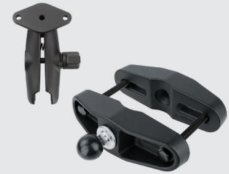
RAM® Square Post Mount 1.75"-4" Wide RAM-B-247U RAM-B-103-238U