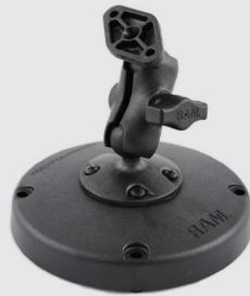
RAM® Platform Double Ball Mount RAP-B-291-A-238U