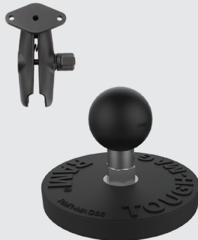
RAM® Tough-Mag™ 66mm Dia. Mount RAM-B-MAG66U RAM-B-103-238U