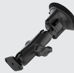
RAM® Twist-Lock™ Suction Cup Mount RAM-B-166U