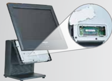
Removable Display & Upgradeable Memory

The accessible design ensures easy replacement of the HDD.