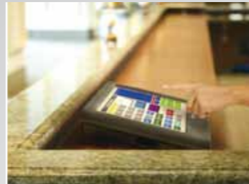
Low profile design